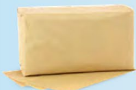
Lining paper for centrifuge cup