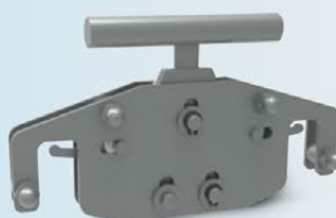
Centrifuge cup fixture