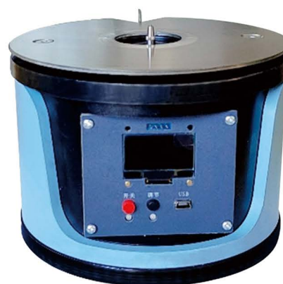
HYBD-2 internal angle calibration device (optional)