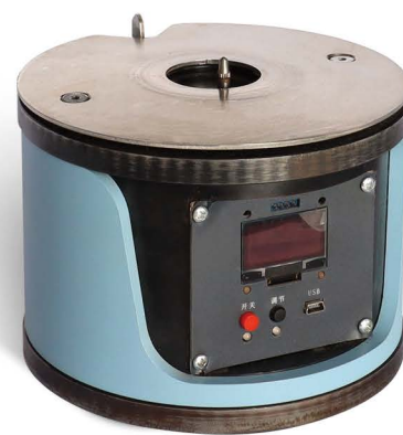
HYBD-2 internal angle calibration device (optional)